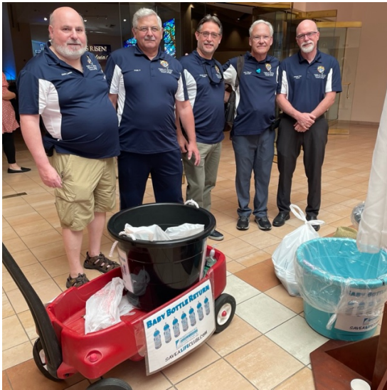
Baby Bottle Campaign St. Thomas - Praying to close now closed Abortion Center in Vegas