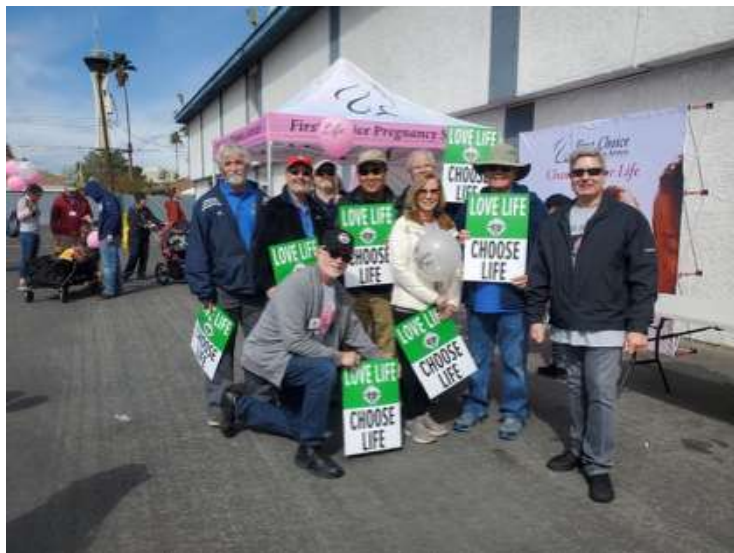
MARCH for LIFE Vegas (First Choice)