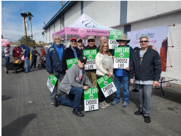
MARCH for LIFE Vegas (First Choice)