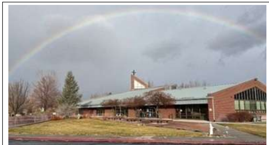
St Gall Parish, Gardnerville, NV

In a world so torn apart by rivalry, anger, and hatred, we have the privileged vocation to be living signs of a love that can bridge all divisions and heal all wounds.