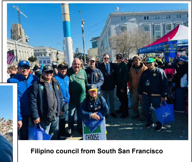
Filipino council from South San Francisco