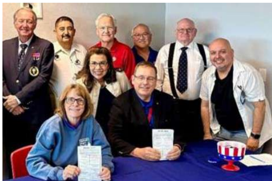
Nevada's Right to Life Team