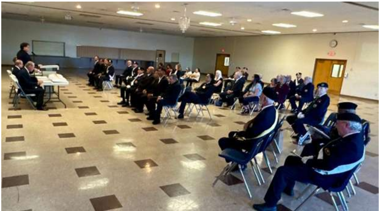
Fourth Degree Exemplification Ceremony at Saint Francis de Sales Catholic Community. Ten men elevated to Sir Knight!