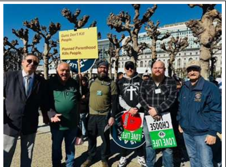
Brother Knights from Sacramento