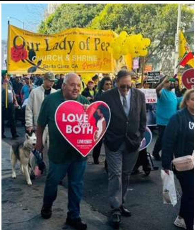
State Secretary and State Deputy