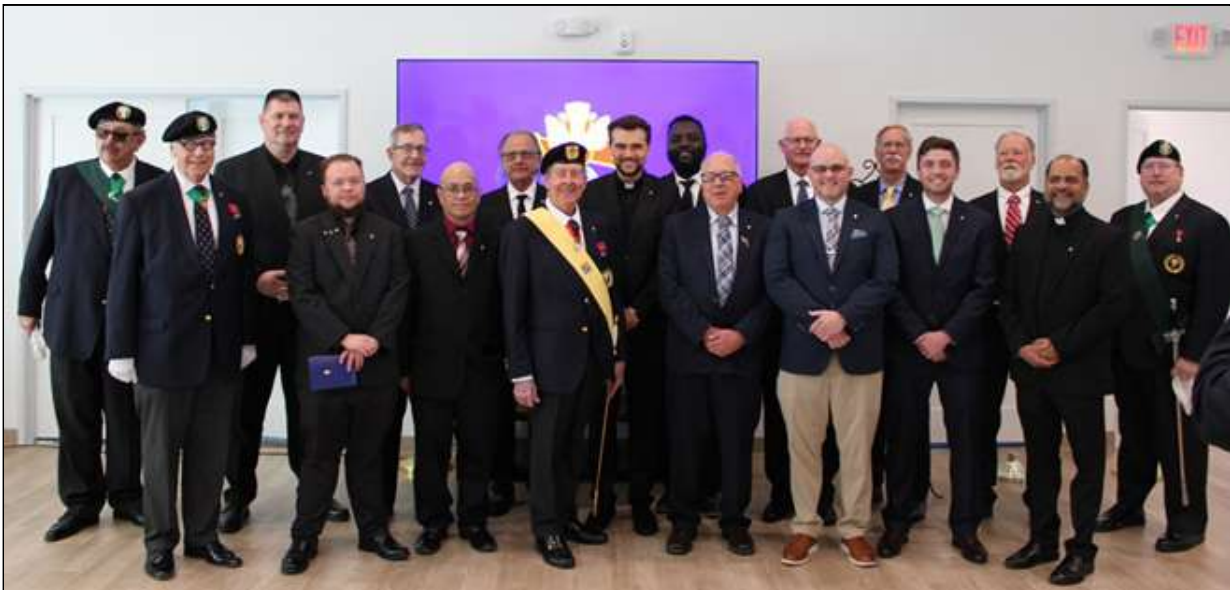
Fourth Degree Exemplification at St. Galls in Garderville on Saturday Mar 28. Thirteen men elevated to Sir Knights!