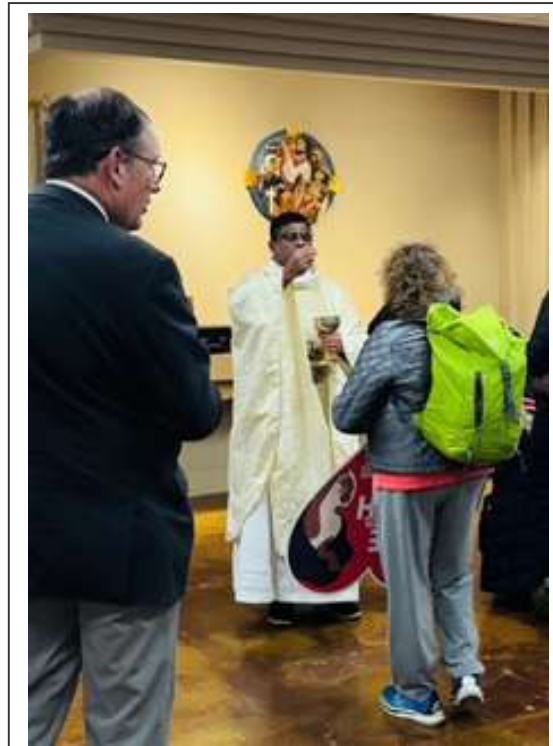
Early morning Mass