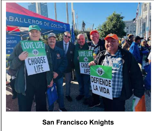
San Francisco Knights