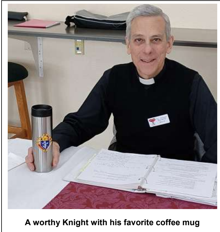
A worthy Knight with his favorite coffee mug